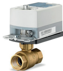
Valves & Actuators